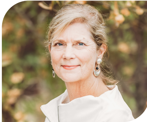
Melita Love Spirit of Wetzel